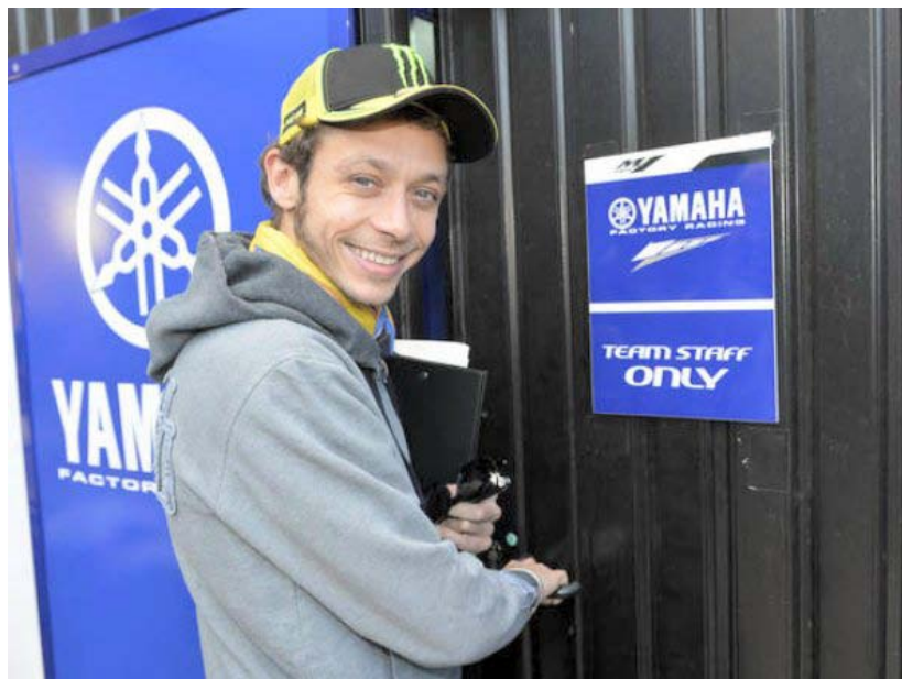
Driver 2013 Valentino Rossi New test for 2013