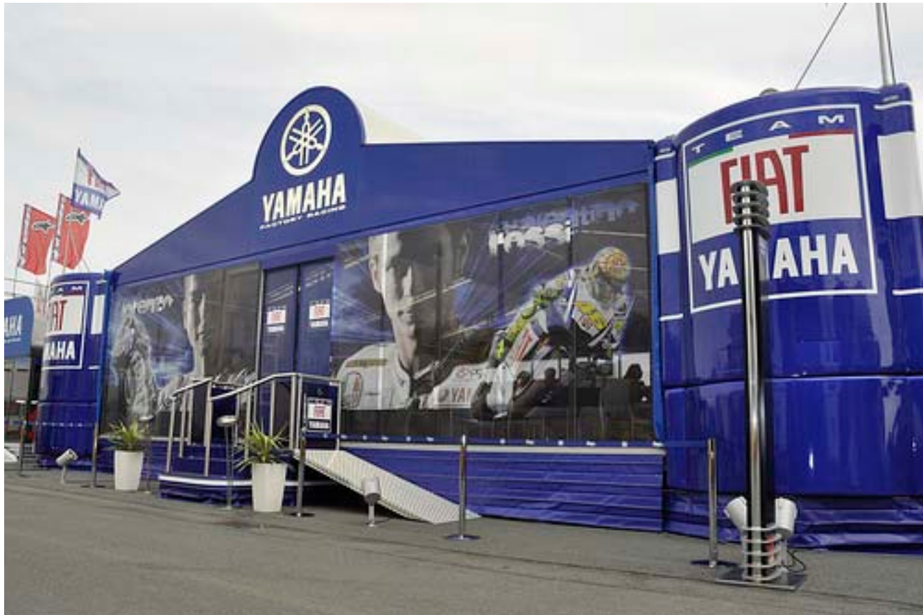
Hospitality Yamaha Factory Racing